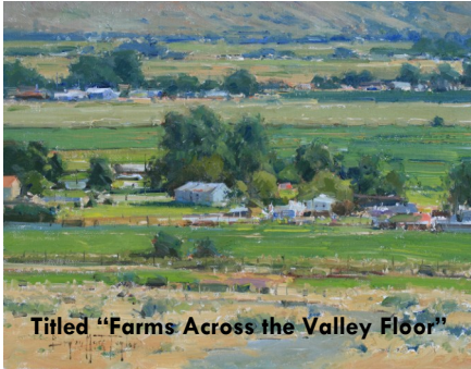
Titled "Farms Across the Valley Floor"